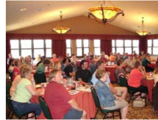
MACDE Summer Training Session & Annual Meeting 2008.

The MACDE Board has again budgeted $300 per area to host an area Training for employees. For example, the Areas of 1, 2, 3, and 8 have been hosting an Administrative Training Session for several years, and have utilized these training funds from MACDE. Area 6 has also hosted several wetland trainings. If you are interested in receiving training funds for your area, contact your MACDE area Director.